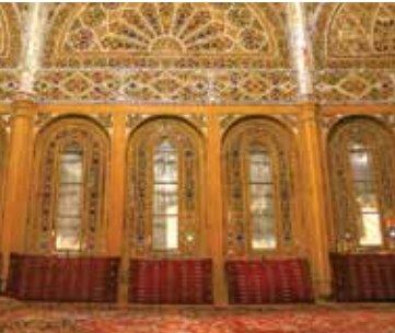
Aminiha House IRNA

The city of Qazvin, the capital city of the north-central province of Qazvin, is one of the historical cities in Iran. Like other Iranian cities including Shiraz, Isfahan, Yazd and Kerman, Qazvin is one of the major historical cities in Iran that was the capital city of the country; in Qazvin's case,