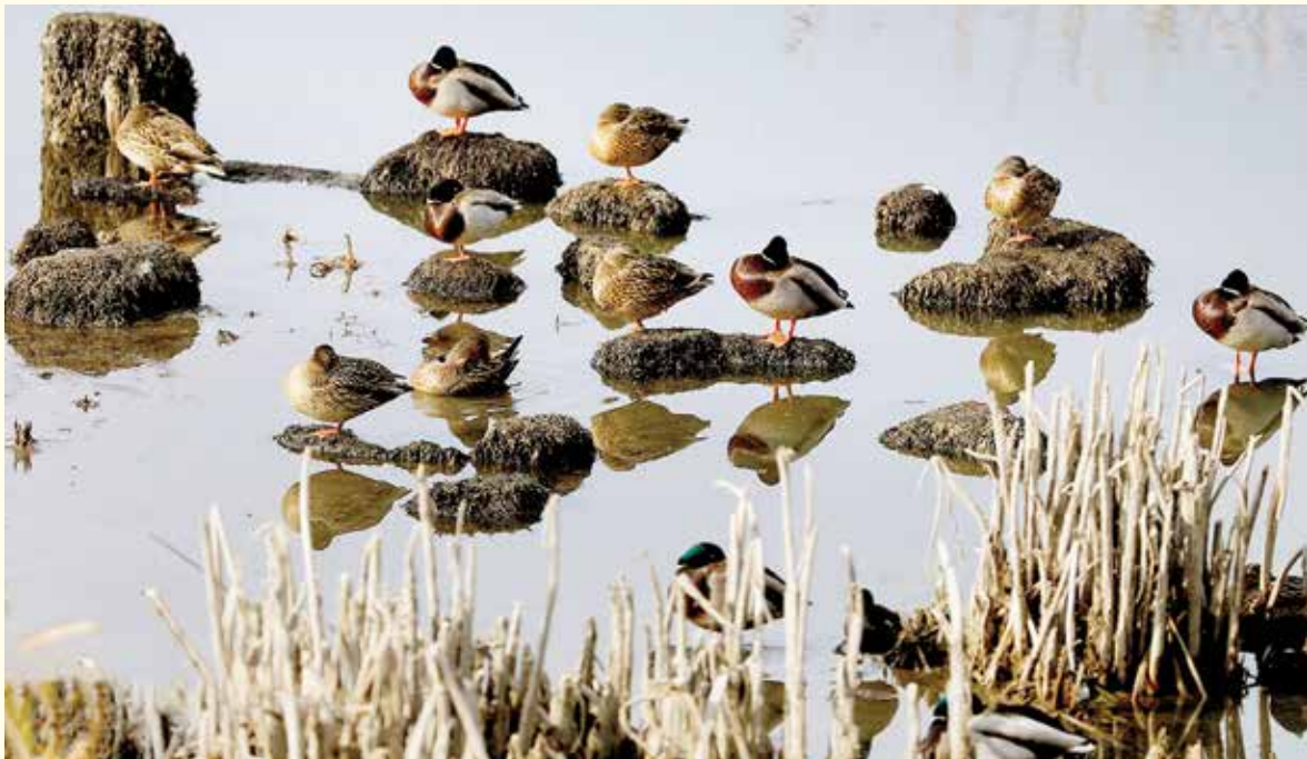
The photo, taken on December 20, 2022 shows the reedy parts of Zaribar Lake, in Marivan, Iran's western Kurdistan Province, hosting native and migratory birds.